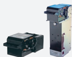
EBA-21-PB / -SD2 / EBA-22-PB2